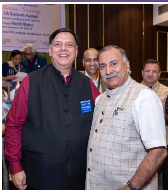
DISTRICT PROG PP N KALYAN